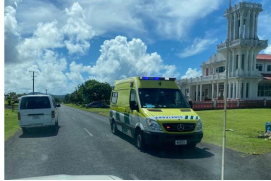
This Rotary sponsored ambulance Spotted on the Samoa's Island of Savaii in early May.

Ambulances are often requested by Health Depts. in Pacific countries. Donations by Rotary Clubs across New Zealand resulted in ambulances being more recently sent to Tonga and Samoa. Samoa's vulnerability became all too apparent during the 2019 Measles Epidemic when they were insufficient vehicles available. An addition to their fleet was sent in 2020 and a further vehicle will be sent in the coming months. The two ambulance providers in New Zealand support Rotary allowing this to happen. Prior to shipping, the ambulances are thoroughly checked mechanically etc. and sign written to acknowledge the donors and incorporate the requirements of the country to which being sent. For clubs wishing to support this activity with likeminded clubs email info@rnzwcs.org for full details.