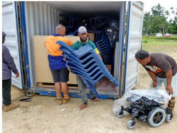
Clubs in Napier and Rotorua also ship D.I.K.

For many years combined Christchurch Clubs have received goods for sending to Pacific country communities. Four 20 ft containers are being sent annually. A network of suppliers has been established who donate all manner of items including surgical hospital beds, linen, wheel chairs and other mobility gear, school desks, chairs, white boards, library readers and other consumables, beds and mattresses, tools, fishing gear etc. All goods are requested. Donations requested to support freight costs Bank Acc. No. 03 1702 0192208 01 Ref: 304