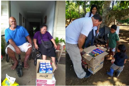
Photographs published with permission

A project for Covid relief has been supported by clubs in New Zealand and USA in collaboration with Nuku'alofa Rotary. The staff of The Mango Tree Centre delivered food and essential supplies to most vulnerable disabled people under their care. 54 families in the first phase of the project followed by a second distribution of food and essential supplies to 40 families. The staff also arranged for the repair of water systems for 5 families damaged by cyclone. Two computers for use in training staff at the Mango Tree Centre were also purchased as part of the project.